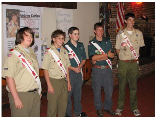
2008 Lodge officers elect