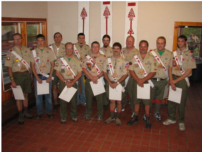
The 2006 Vigil Candidates after their nominations in Wyckoff Lodge.